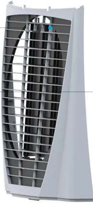
3 Speed Fan System