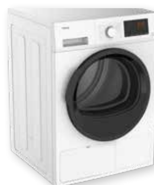
8kg Heat Pump TCD80ASHAG